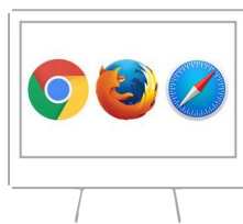
PC and Mac Chrome | Firefox | Safari